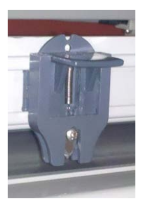
cutter permits simple cutoff as the laminated material exits the rear of the machine