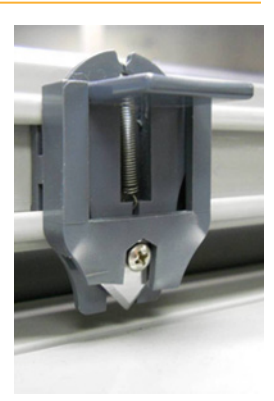
Cross cutter permits simple cutoff as the laminated material exits the rear