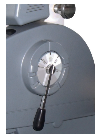
5 position lever adjusts the nip between the rollers while springs maintain even pressure during lamination.