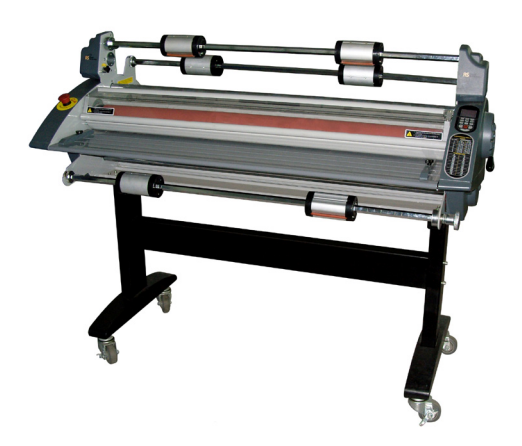
RSH-1651 65" Laminator