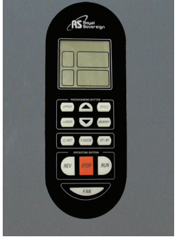
Auto grips to secure User friendly controls Cross film cores to feed and simplify operation simple