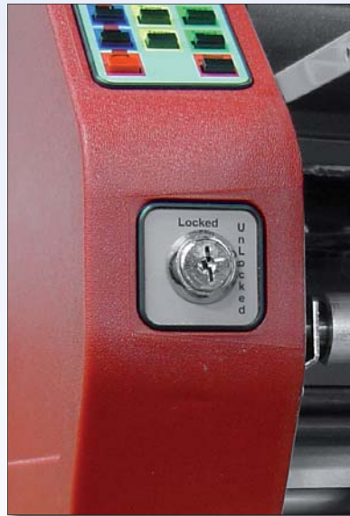
Key Switch Prevents Unauthorized Users