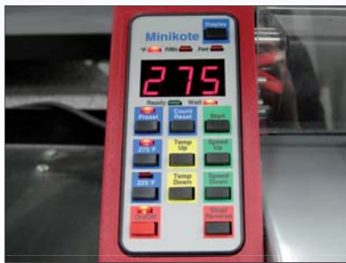
Touch Pad Controls